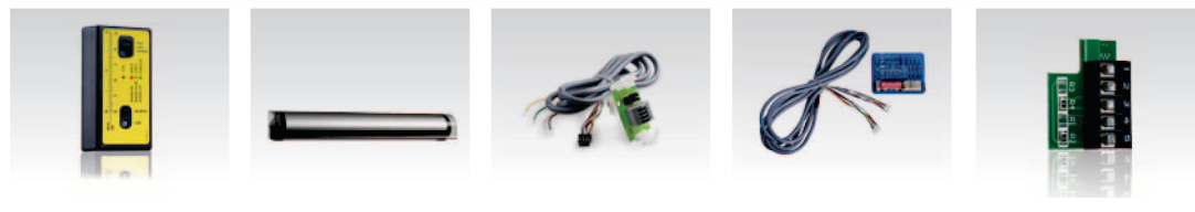
Spotfinder Rain Accessory Fire Door Adapter Multisensor hub Retrofit interface